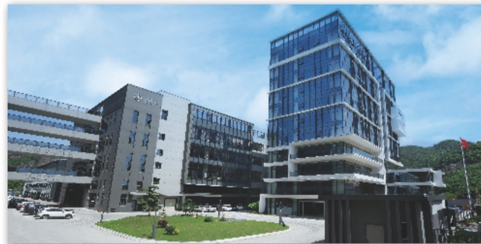
VMV Newton Headquarter (Wenzhou)

We have also qualified with CE,ISO,TS A1,API,DNV,EAC certificates etc.